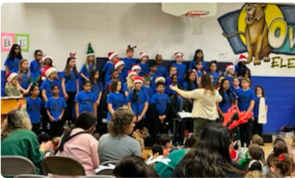
Jingle Bell Assembly