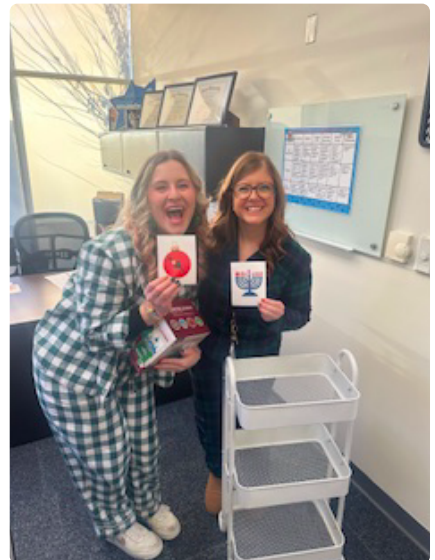
Staff Scavenger Hunt